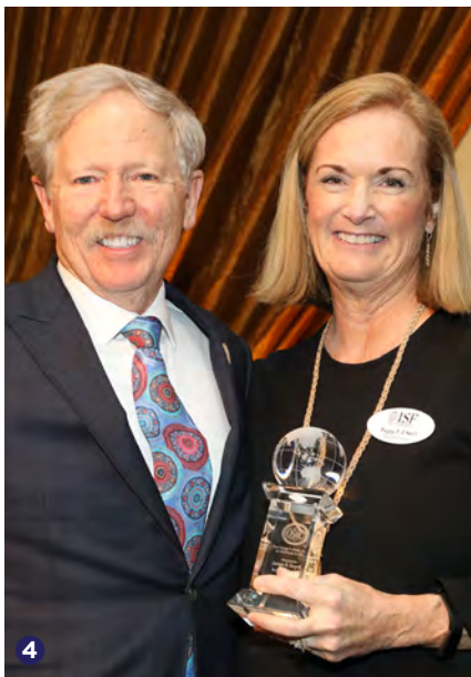
From top left: